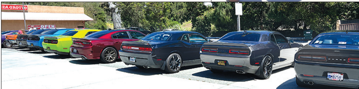
Above: Getting ready to run . . . Left: MCSD Mopars in the South County back country