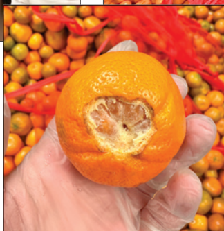
Left: Discovered in the bins of mandarins was this one, damaged in the shape of a heart, which brought lots of smiles