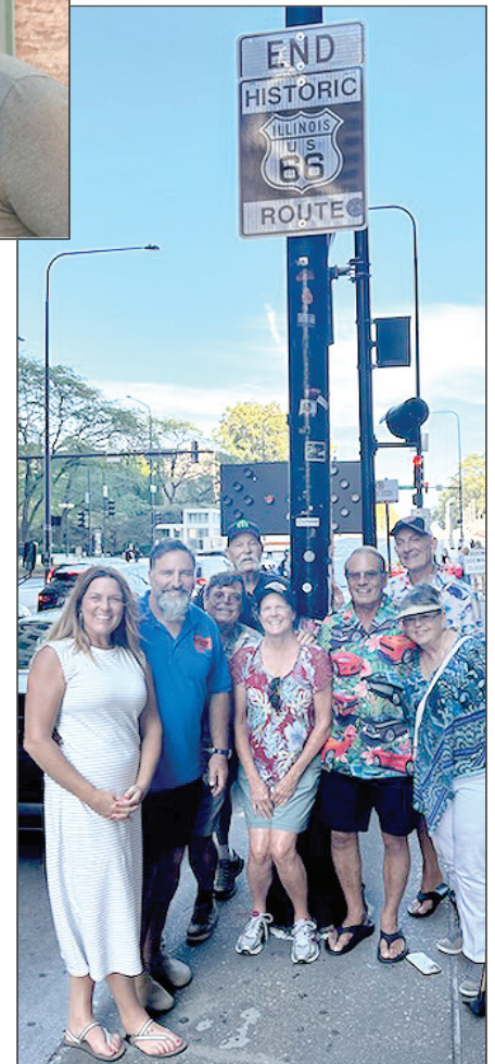
The end of the road, in Chicago