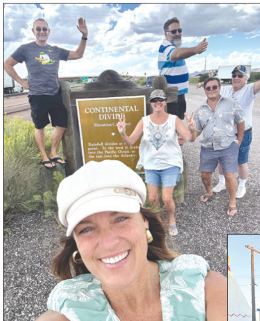
At the Continental Divide, above, and at the historic Wigwam Motel, right.