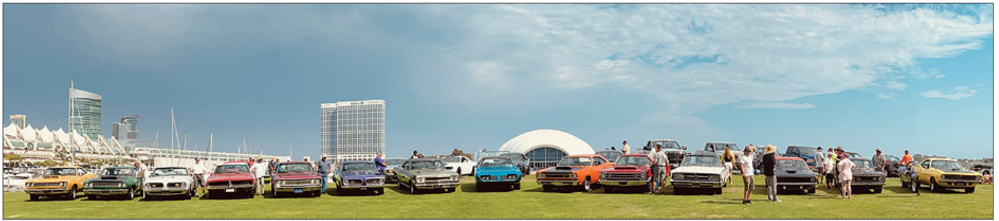
Front view of Mopar Club SD classics at our All-American Car Show 2025