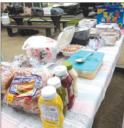
Lots of picnic goods and goodies