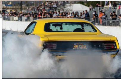
Jonathan warms up the tires at Irwindale.