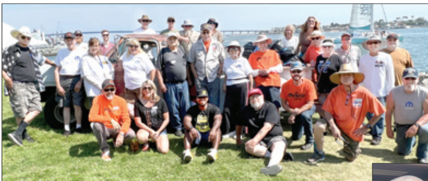
Above, some of the many club members who worked the club's All-American Car Show at Seaport Village last July, raising $15,000 for our military beneficiaries.