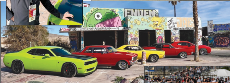
Defunct water park is still a cool playground