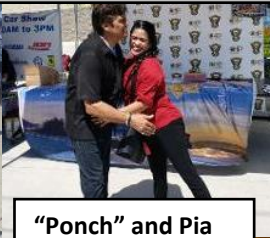
"Ponch" and Pia