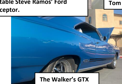
The Walker's GTX