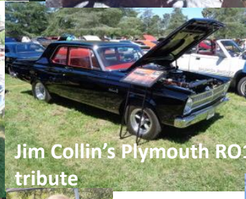
Jim Collin's Plymouth R01 tribute