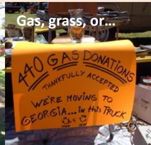
Gas, grass, or...