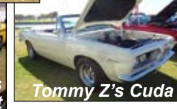
Tommy Z's Cuda