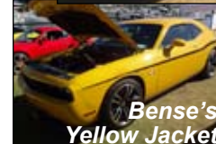
Bense's Yellow Jacket