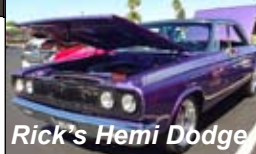
Rick's Hemi Dodge