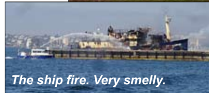
The ship fire. Very smelly.